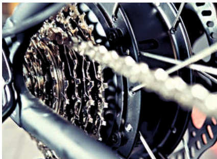
B021 CHAIN OIL SPRAY