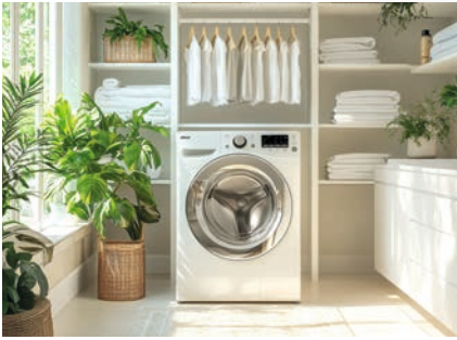
H011 STAIN REMOVER PREWASH