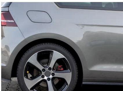
L001 BRAKE CLEANER