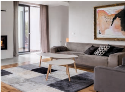
H020 AIR FRESHENER