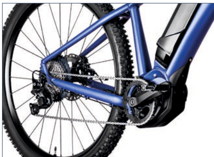
B024 BEARING GREASE